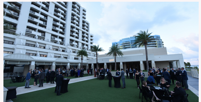
FAIR Awards Gala Cocktail Reception

Visit federalinsurancereform.org/events for more event photos and highlights.