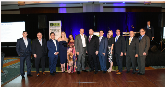
Members of the FAIR Board